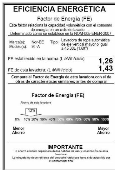
Figure 3. Energy Efficiency label for a washing machine

Under Mexican law and as an element of the standards, CONUEE also implements a mandatory (as shown in Figure 3) comparative labelling program for room and central air conditioners, refrigerators and/or refrigerator-freezers, clothes washers, centrifugal residential pumps, gas water heaters, commercial refrigeration, and non-residential building envelopes.