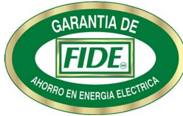
Figure 4. FIDE's Label logo